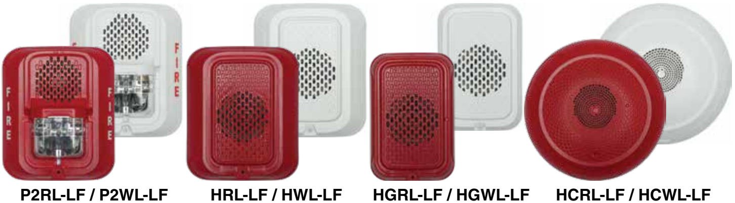
P2RL-LF / P2WL-LF