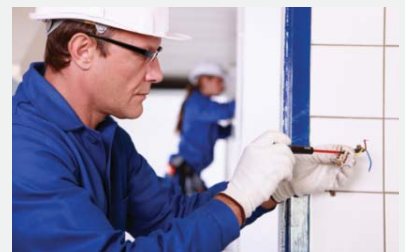
for the Engineer