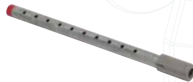
DST Sampling Tubes DST1 - ducts up to 1 foot DST1.5 - ducts 1 to 2 feet DST3 - ducts 2 to 4 feet