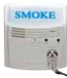
RTS2-AOS Multi-signaling accessory with add-on strobe 20-29 VDC; UL S2522