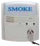
RTS2 Multi-signaling accessory without strobe 20-29 VDC; UL S2522