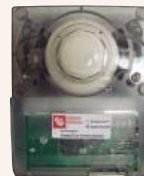
SD505-DUCTR Addressable Duct Detector with Built-In Relay / SD505-DTS-K Addressable Duct Detector Test Switch