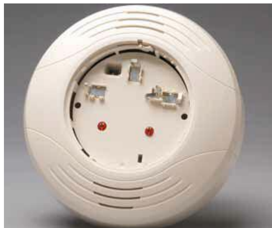
B200S Sounder Base