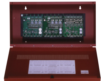
BB-6 Enclosure with CH-6 Chassis