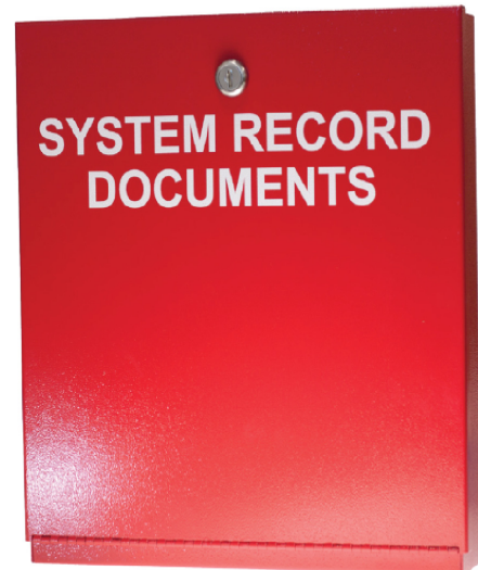
System Records Document

GW-SRD: System Record Documents Cabinet, Red