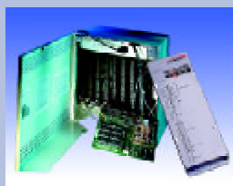
Access Control Systems