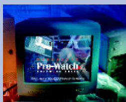
Security Management Systems