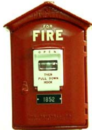
Three-Fold Fire Alarm Box