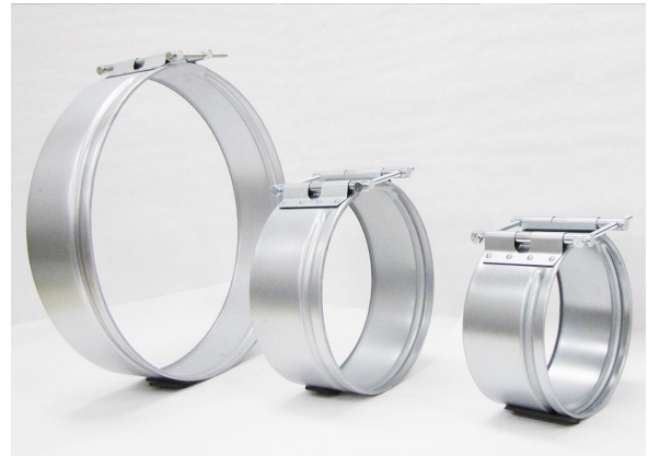
Drawband Clamps - 14", 8", and 6" sizes shown