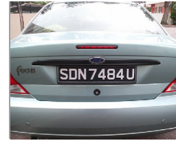
White letters on dark backgrounds