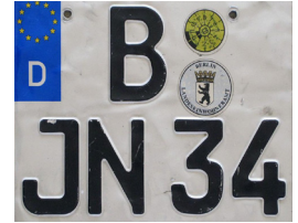
Double line license plates