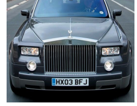
Dark letters on a light backgrounds