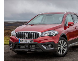
Vehicle approach angles