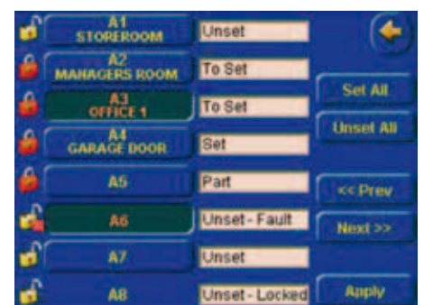
Area/Group set status