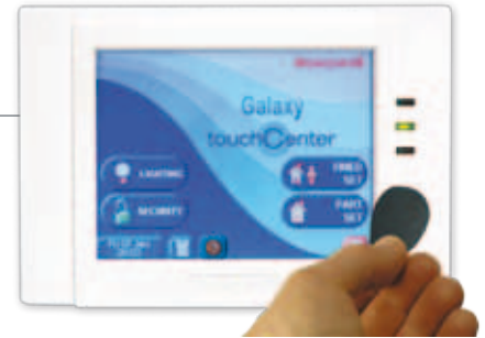
Quick and secure set/unset with PIN code or Prox tag