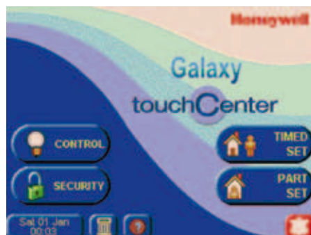
Standard home screen