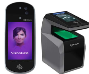
Frictionless access control with VisionPass and MorphoWave Compact from IDEMIA, integrated with Pro-Watch

Using IDEMIA's award-winning biometric technology, users are able to enroll and manage biometric templates within Pro-Watch providing a truly integrated and seamless user experience. Supported devices include the latest from IDEMIA such as MorphoWave contactless fingerprint scanning and VisionPass facial recognition, for minimizing surface contact, as well as the SIGMA family of fingerprint readers.