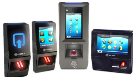
Fingerprint-based access control in the SIGMA series from IDEMIA, integrated with Pro-Watch