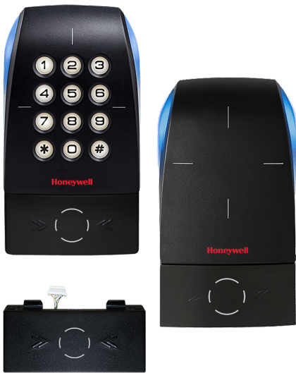
Omni Arch readers with low-frequency prox module. Prox module can be purchased separately