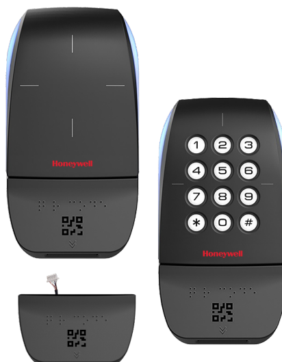
Omni Arch Readers with QR Code reader module. QR Code module can be purchased separately