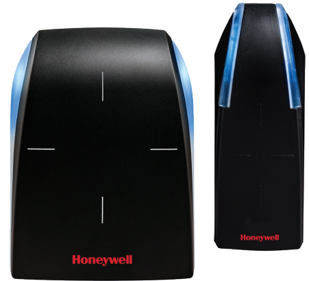
Omni Arch base high-frequency readers