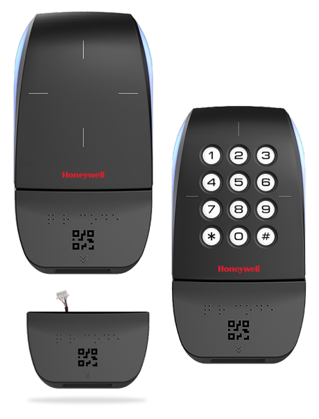
Omni Arch Readers with QR Code reader module. QR Code module can be purchased separately