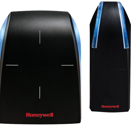
Omni Arch base high-frequency readers