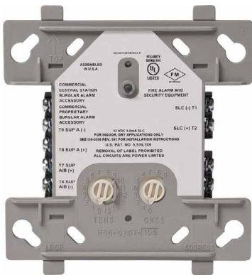
FMM-1 Monitor Module