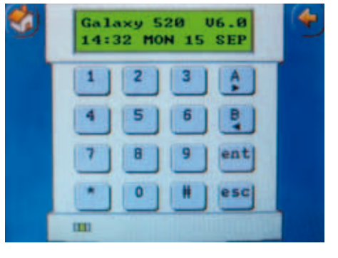
Familiar MK7 emulation