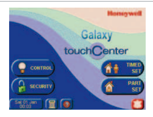
Standard home screen