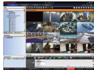
MAXPRO VMS Client Viewer 4x4

MAXPRO VMS includes integration with Honeywell's Pro-Watch® security management system, Active Alert® and People Counter video analytics, as well as other Honeywell products and solutions. The feature-rich user interface truly offers a unified management platform across many disparate systems to further embody Honeywell's concept of "Learn One, Know Them All."