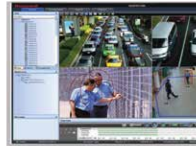
MAXPRO VMS Client Viewer 2x2

Control of MAXPRO VMS can be through a traditional joystick controller, mouse or even through third party interface. The extremely powerful rules engine (Macro's) allows customization of the system to respond and control in the best possible manner for the application. MAXPRO VMS is highly scalable so users can easily expand their video surveillance network from small to medium single instances to enterprise level supporting thousands of devices. Additionally,