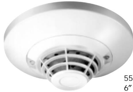
5551R with 6" base

The 5551R Intelligent Thermal Sensor will alarm at 135° F and at an increase in excess of 15° per minute. This enables the heat detector to communicate an alarm to the central control panel prior to reaching the static set point, providing a timely response to rapid temperature increases.