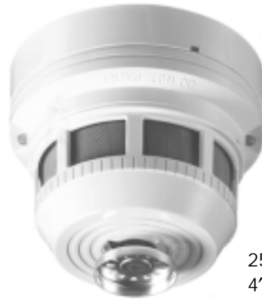
2551THR with 4" base

The 2551THR Intelligent Photoelectronic Sensor adds a thermal heat collector that will alarm at a fixed temperature of 135°F.