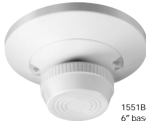
1551B with 6" base

The 1551B Intelligent Ionization Smoke Sensor's unique unipolar chamber responds quickly and uniformly to the broadest range of fires and can withstand wind gusts up to 1500 feet-per-minute without outputting an alarm level signal. Because of the unipolar chamber, the 1551B is more responsive than most ionization sensors. This makes it a more stable detector.