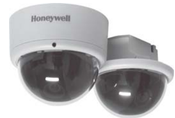
HD3DX shown with mount ring for surface mount