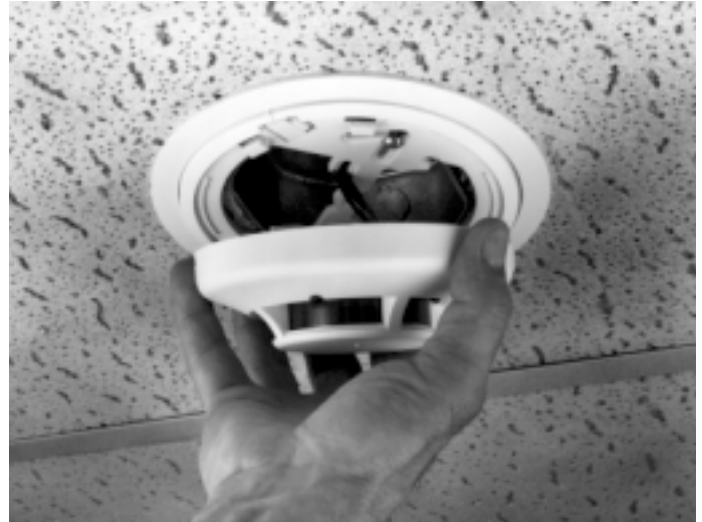
Figure 2. Install detector.