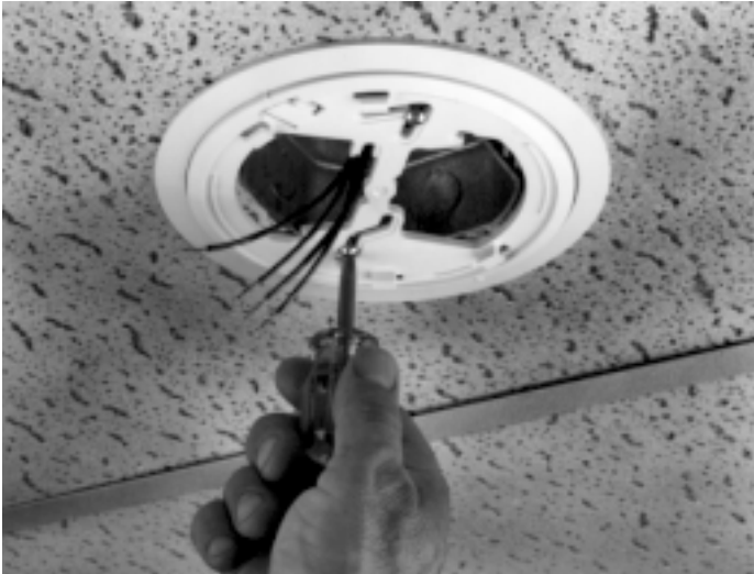
Figure 1. Install adapter bracket between ceiling and mounting bracket.