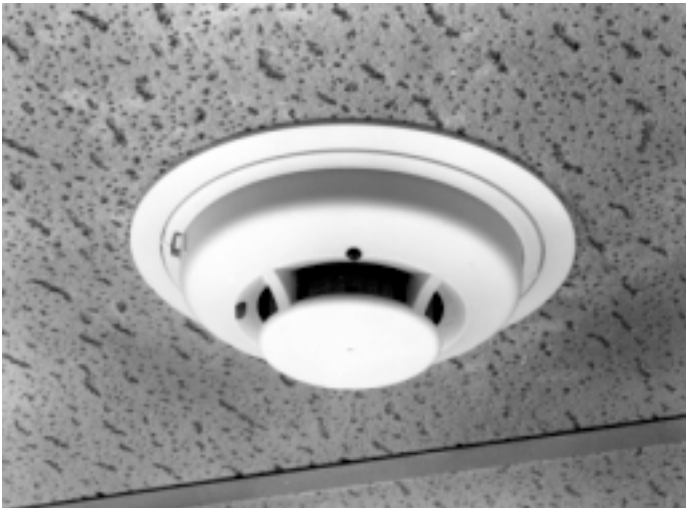
Figure 3. Adapter bracket covers previous detector footprints and flawed installations.