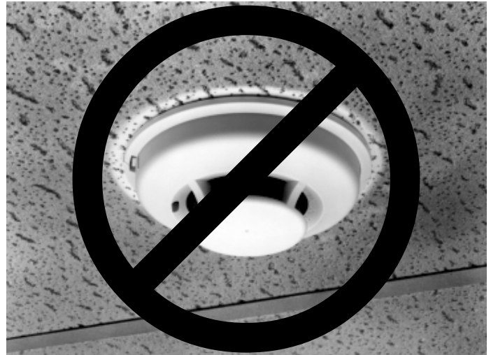
Figure 4. Detector without adapter bracket