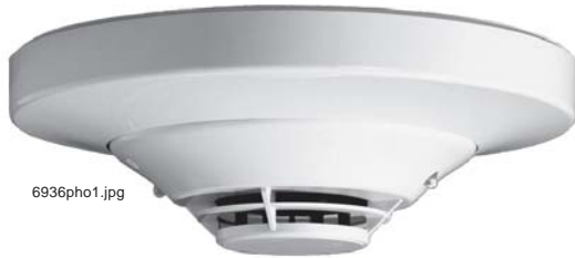
SS-T in SS-B6 base