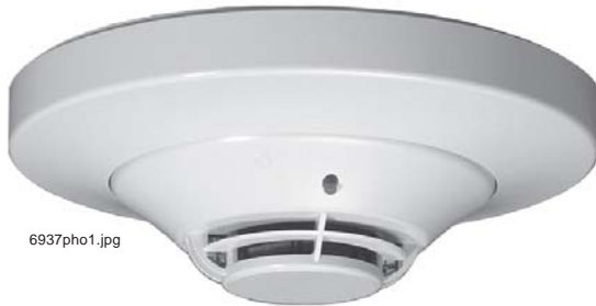
SS-APT in SS-B6 base