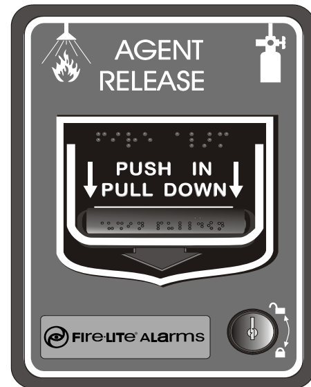
Dual Action BG-12LR