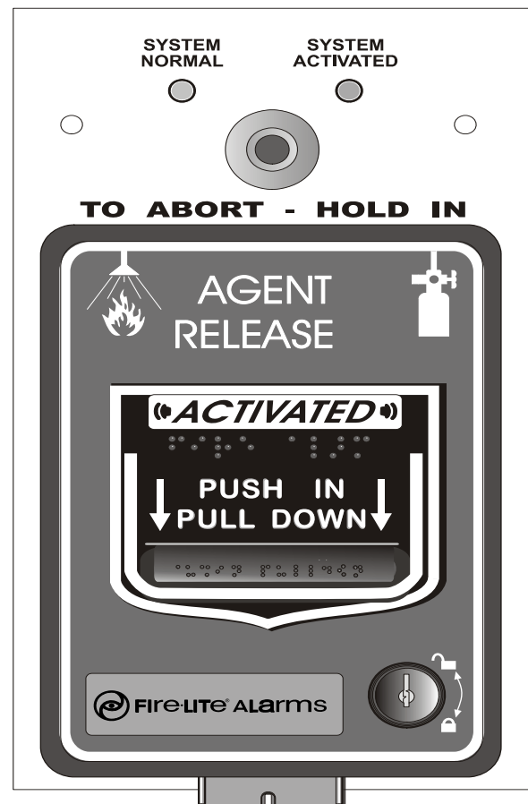
Dual Action BG-12LRA (shown activated)