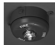
Outdoor Ceiling Strobe