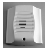
Indoor Wall Horn