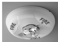
Indoor Ceiling Horn/Strobe