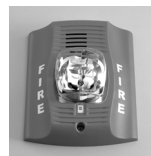
Indoor Wall Horn/Strobe