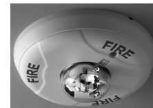
Indoor Ceiling Strobe