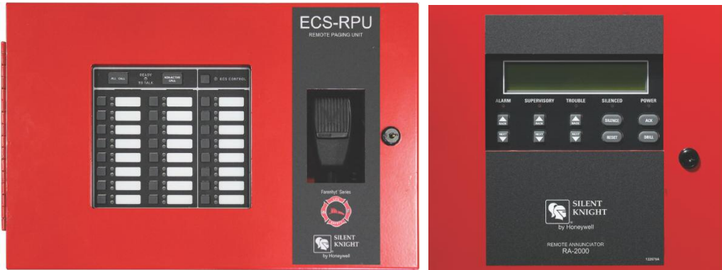
ECS-RPU shown with an RA-2000