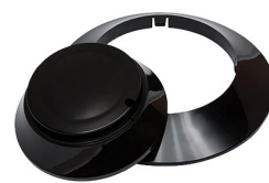
CK300-IR-BL Color Kit