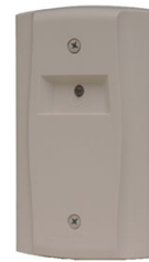
RA100Z Remote LED Annunciator