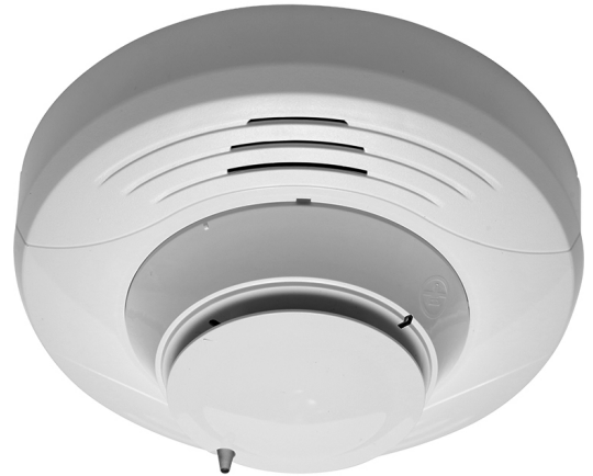
IDP-PTIR-W in B200S-WH sounder base

The PTIR detector meets both UL 268 7th edition and UL 521 listing requirements and can indicate distinct smoke and heat alarms. This dual nature supports a local alarm setting for photoelectric detection and a general evacuation setting based on thermal detection. This can minimize work interruptions in multi-level buildings.