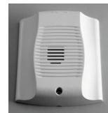
Indoor Wall Horn