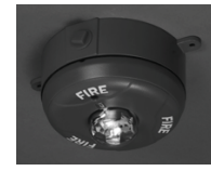
Outdoor Ceiling Strobe