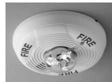
Indoor Ceiling Horn/Strobe