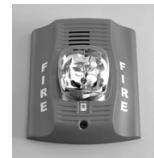
Indoor Wall Horn/Strobe