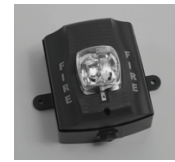
Outdoor Wall Strobe