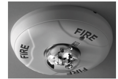
Indoor Ceiling Strobe