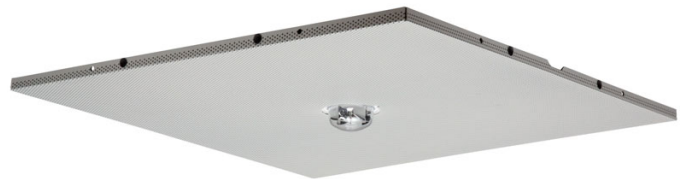
Speaker Strobe shown (as installed and close-up)