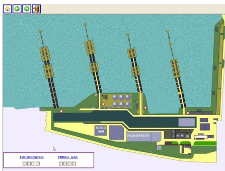
Area display with several zones