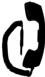
FFT-RHS Fire Fighter's Remote Hand Set