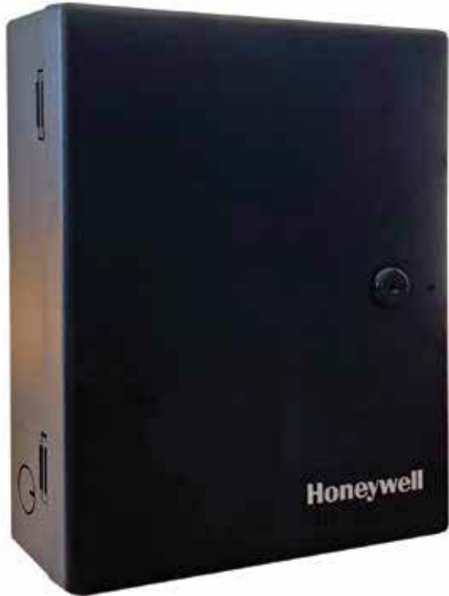
CLSS Gateway – (HON-CGW-MBB)