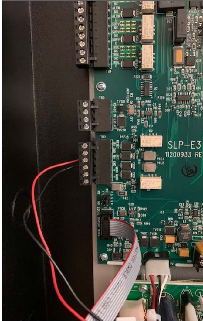
S3 Power Connections