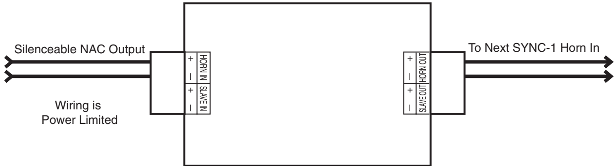
FIGURE 3: HORN OPERATION