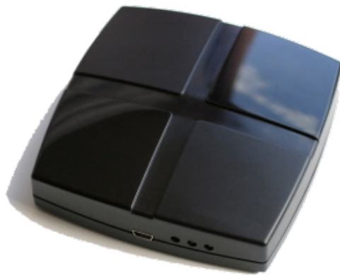
Figure 1. PC501 Protocol Converter

The PC501 protocol converter bridges Honeywell's INNCOM Integrated Room Automation System with 3rd-party interfaces to provide onscreen guestroom environmental control through TV, smartphone, or other digital devices. Using a USB cable both for power and for data transfer to a set-top box, the platform-independent PC501 can translate settings from the 3rd-party interface to standard P5 commands for heating, lighting, or other room equipment. In turn, the PC501 can forward information from INNCOM-controlled environmental systems back through the 3rd-party interface for display and adjustment onscreen. The PC501 features S5bus and RF communications.