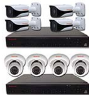
NVR + 4 cameras