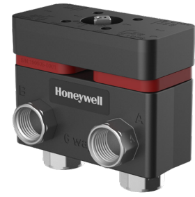
Valve assemblies as compact as 4.14" x 6.63" x 6.85" available.

Our compact, modular 6-Way Control Valve makes it easy to design a more efficient, reliable hydronic system with true equal percentage control for both heating and cooling with a single valve – for more wide ranging cost-savings.