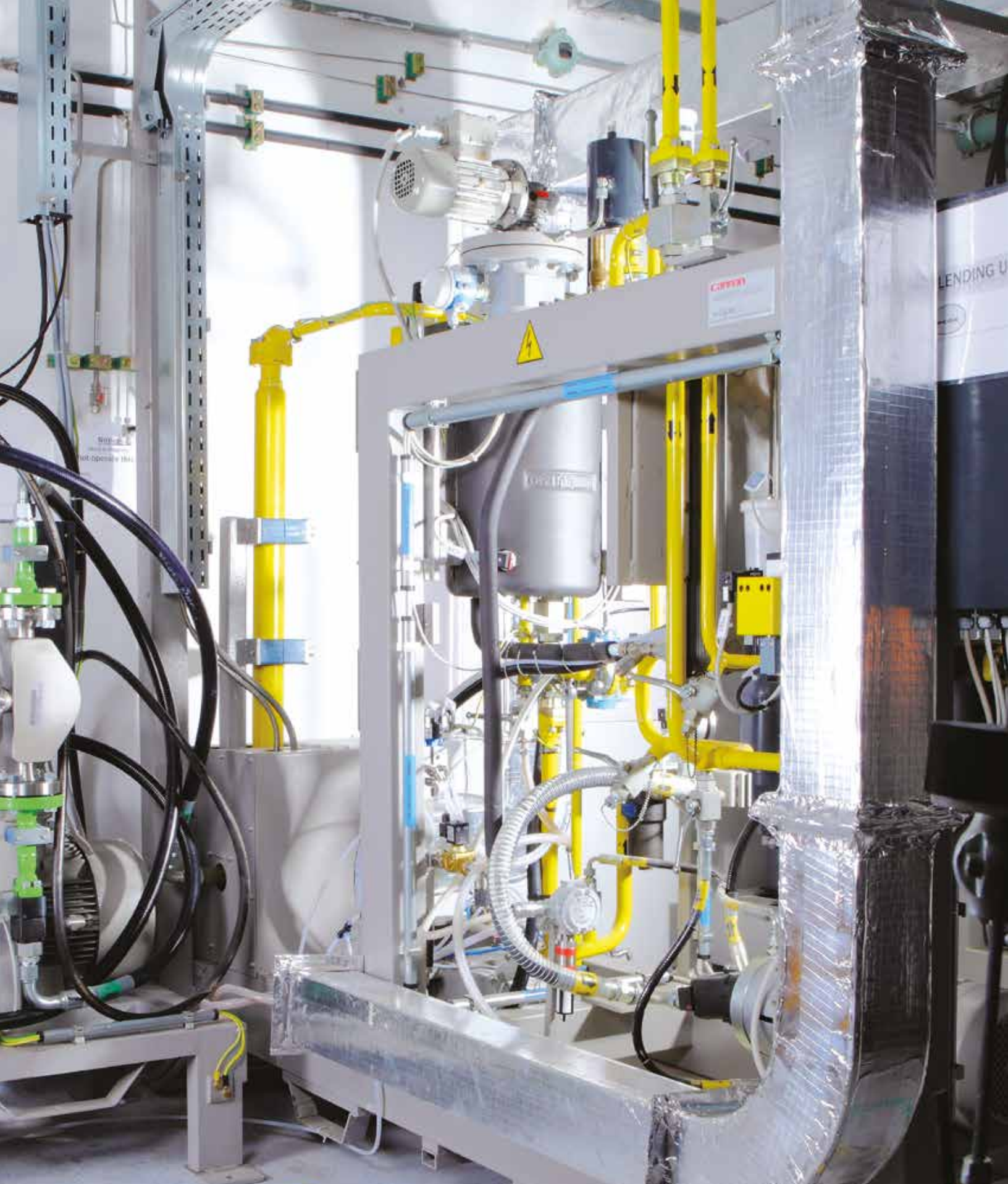
Our high-pressure foam machines are capable of handling flammable blowing agents and can replicate appliance, panel, and pour-in-place operations. This one is located in our India Technology Center in Gurgaon.