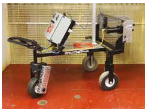
Our robotic machine can be used to ensure consistency and repeatability in spray test sample preparation.