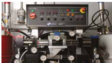
We use state-of-the-art spray foam machines, including third stream gas injection capability.

Our global technology centers for foam blowing agent research, development, and technical support are equipped with state-of-the-art high-pressure foam machines, spray foam machines, foam thermal conductivity testing equipment, and a full array of mechanical property testing equipment, including compression/tensile testers, rate of rise measurement instruments, environmental chambers, pycnometers, optical microscopes, and other essential equipment. In addition, these laboratories are fully equipped with analytical equipment to test polyol premixes for a variety of properties and foam for cell gas content.