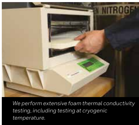
We perform extensive foam thermal conductivity testing, including testing at cryogenic temperature.