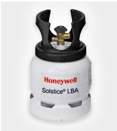
Solstice Liquid Blowing Agent (LBA)