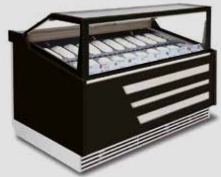
Juka Paradiso 18

“When our first customer switched to our new insulation solution, it proved that the polyurethane system was a drop-in replacement for HFC-variants or water-blown systems without any need to change the machinery set up.”