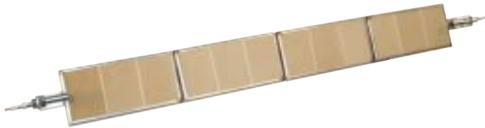
Front view – Type 25 (end-to-end) assembly