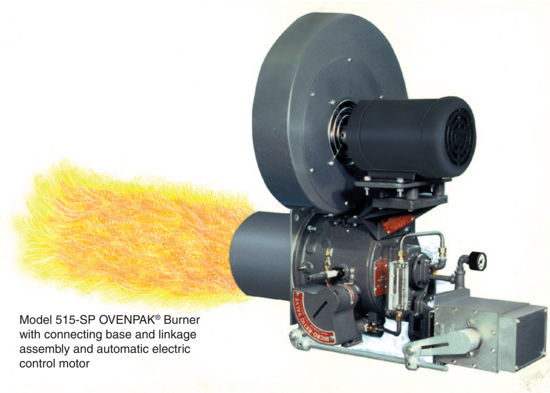
Model 515-SP OVENPAK® Burner with connecting base and linkage assembly and automatic electric control motor