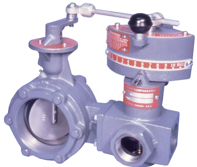
Air Gas M- 4" x 1-1/2" -P MICRO-RATIO® Valve

MICRO-RATIO® Valves covered by U.S. Patents 2,286,173; 2,035,904; and 3,706,438.