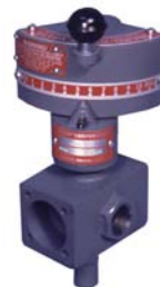
1" -O -400 SYNCHRO