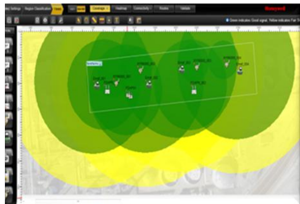
RF Lite provides a graphical display of the wireless network components and field device coverage map.

RF Lite R100 uses best engineering practices and very conservative RF and device connectivity rules to plan a wireless network.