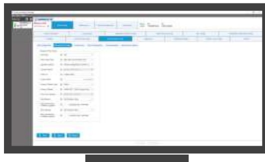
SmartLine Modbus Manager

SmartLine Multivariable Transmitter SMV800 can be configured using 'SmartLine Modbus Manager' a user-friendly, intuitive and comprehensive PC based Modbus host.