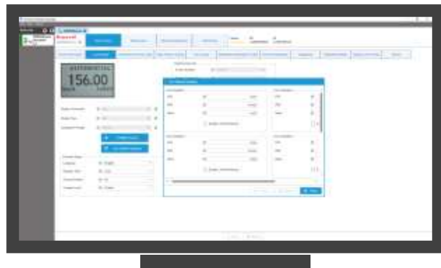
Configurable user defined variables

This provides field technicians with quick insight into process, which aids in maintenance. Screens can be configured for rotation time of 3s to 30s to display the variables at defined intervals.