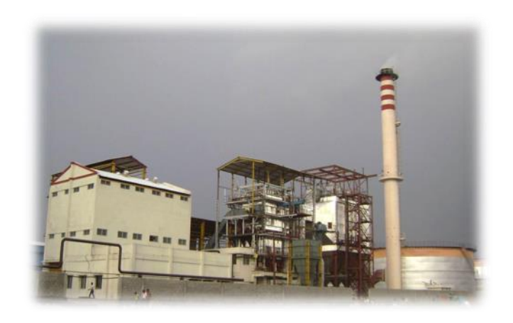
Figure 1. Sugar plants need solutions to improve productivity and reduce costs.

Food and beverage market demands producers to deliver highest level of plant efficiency, quality, and safety to enable profitability. Sugar production in particular, is a tough business even in a prosperous economy, and under the current conditions, it is more difficult than ever before. Fluctuations in raw material, rising costs, globalization, changing consumer demands and skilled labor shortages place ever-greater pressure on operating companies.