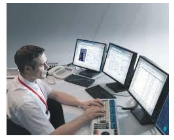
A new breed of DCS is designed to meet the needs of control applications of all sizes.

In addition, the new generation of DCS enables industrial firms to respond swiftly to constantly changing market requirements. Integrated safety concepts ensure continuous operation of systems and protect personnel, machines and the environment. They offer high system availability, investment security, and future-safe technology, together with a reduced total cost of ownership.