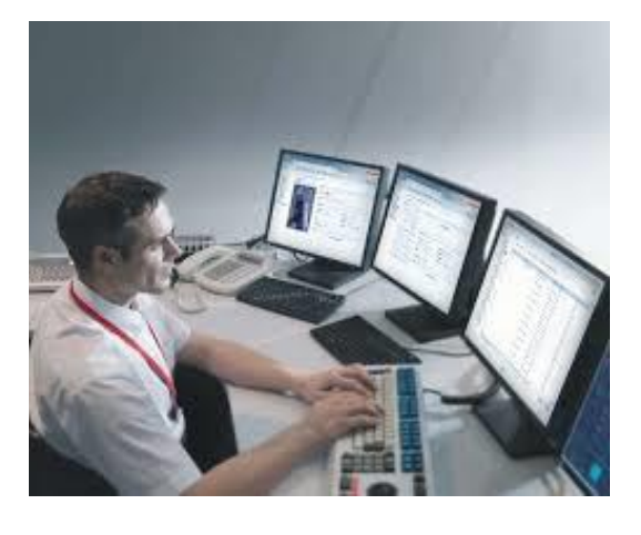
A new breed of DCS is designed to meet the needs of control applications of all sizes.

Major automation suppliers provide purpose-built DCS solutions, which can be tailored to fit specific control applications – regardless of their scope.