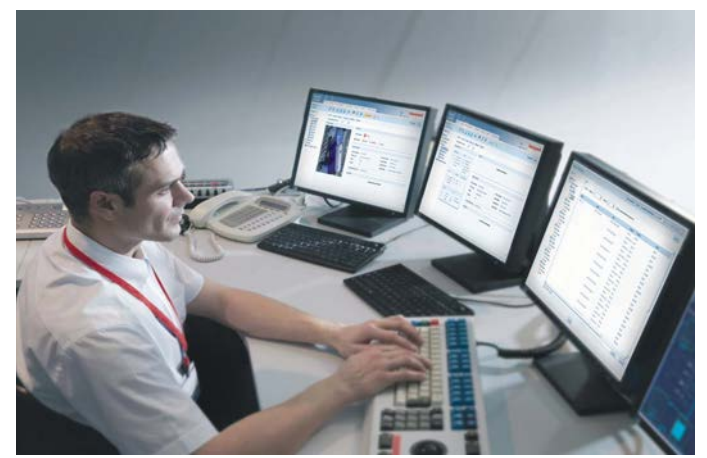
Nirani Sugar considers PlantCruise by Experion a user-friendly system that is easy to program.

PlantCruise is a modern, advanced, and reliable distributed control system (DCS) specifically designed for small and medium enterprises. It helps maximize users' production uptime, improves safety, reliability, and efficiency, and reduces investments and operating costs. This Honeywell-designed product is engineered, maintained and sold through local system integrators, such as SPA Instruments.