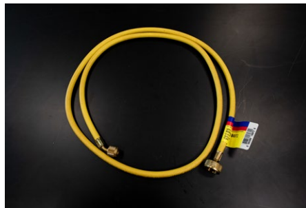
A liquid discharge line with a CGA-660 connection and gasket is required