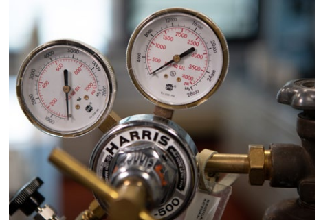
Prepare the nitrogen cylinder