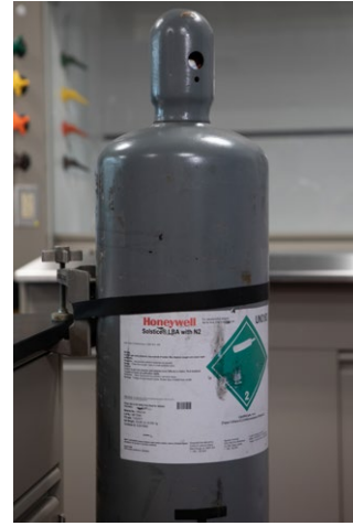
Check the cylinders

As mentioned earlier, connections may vary by region so contact your Honeywell representative if you require assistance.