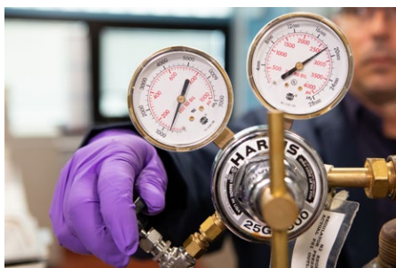
A two-stage nitrogen regulator is required