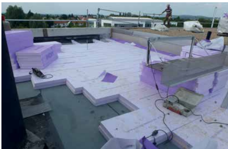
Inverted roof insulation with JACKODUR Plus for University of Applied Sciences in Lemgo

Hence the company's search for a gas blowing agent (GBA) that would help improve on Lambda levels of 34-37 mW/mK using CO 2 (JACKODUR KF) or HFC-152a (JACKODUR CFR). XPS produced using HFC-134a exhibited better thermal conductivity (29-31 mW/mK) but at a high global warming potential (GWP) of 1,300*1.