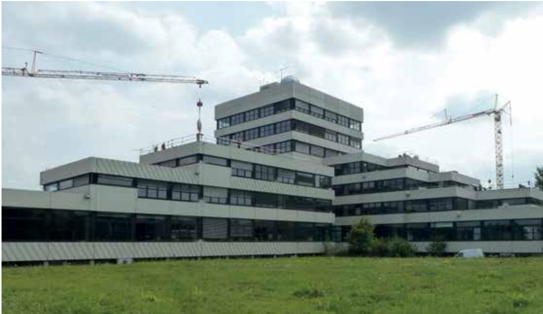
University of Applied Sciences in Lemgo