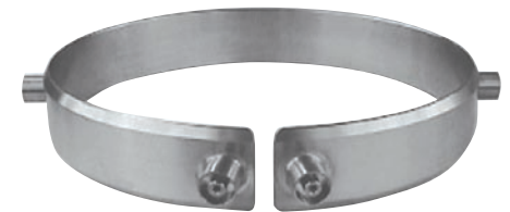
Titanium EB Coil Set