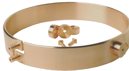
Copper Coil Set

Additionally, cleaning is performed in house in dedicated OEM certified cleaning lines. Materials are segregated to prevent cross contamination and the clean tanks are maintained daily.